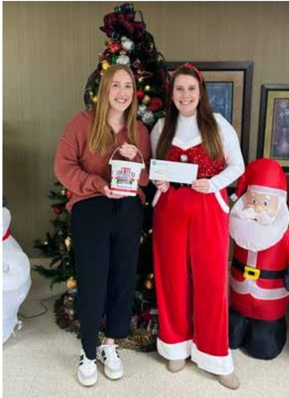
Crestpark DeWitt nursing home received their First Electric capital credit check in December.

We thank you for your continued trust in First Electric Cooperative. You helped build this cooperative — and now, through capital credits, YOU get the credit.