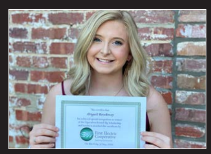
Nine high school seniors were awarded $17,000 in scholarships from Operation Round-Up.