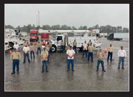
Our crews aided other cooperatives in state and out of state with power restoration due to storms like Hurricane Laura.