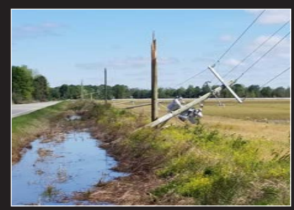
When severe storms caused major outages for our Stuttgart district, our crews worked tirelessly for days to replace over 190 power poles and miles of downed power lines.