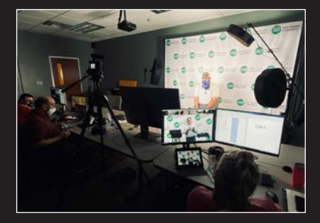
Safety demonstrations and educational presentations were virtually presented to more than 3,480 students and professionals.