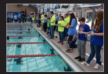
More than 82 community events were sponsored including the Arkansas 4-H SeaPerch Challenge and multiple local spelling bee contests.