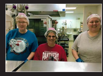
Operation Round-Up funded more than $86,000 in donations to 61 local nonprofits.