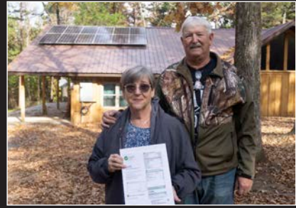
We installed our first residential solar array. The 4.62kW array was installed in Greers Ferry in Cleburne County.