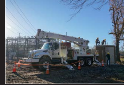
Connect 2 First Internet began the build out of a fiber infrastructure which will eventually make high speed internet available to our members.

First Electric's employees strive to provide you — our members — with the best member service possible. Almost 9,000 surveys were sent and nearly 12 percent offered feedback about their experience with the cooperative. The data collected rates office staff, field personnel and overall quality of service provided.